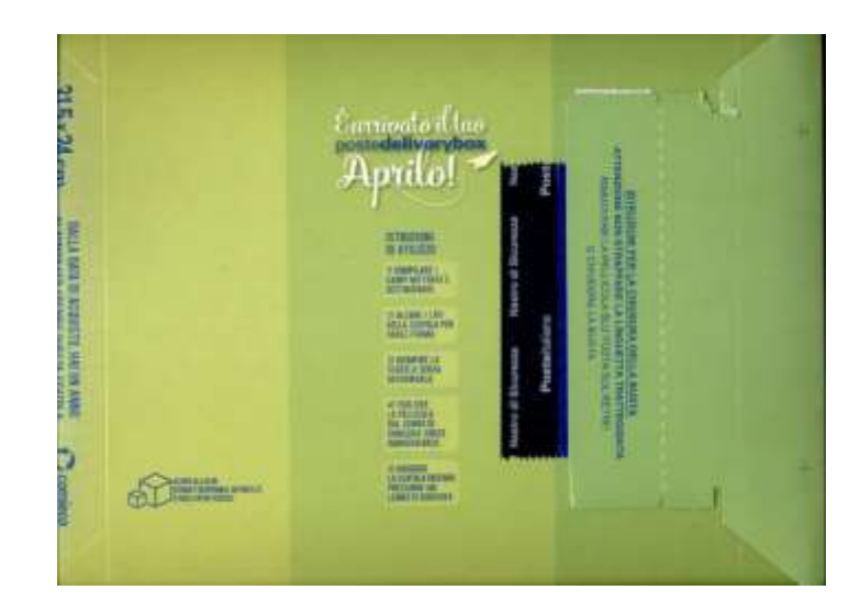
Front View of Speciemen Return Envelope