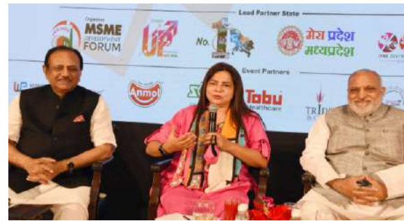
Smt. Meenakshi Lekhi, Minister of State for External Affairs and Culture