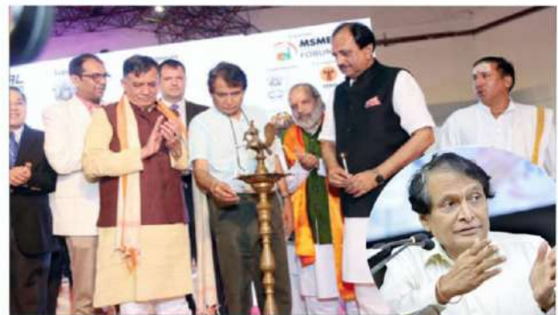
Sh. Suresh Prabhu, Union Minister of Railways, Commerce & Industry with Sh. Satish Mahana, Industry Minister, U.P & Sh. Jai Bhagwan Goel Inaugurating 5th Expo