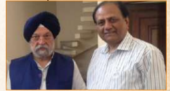
Sh. Hardeep Singh Puri Minister of Petroleum & Natural Gas, Housing & Urban Affairs