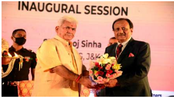
Sh. Manoj Sinha, Lieutenant Governor of Jammu & Kashmir