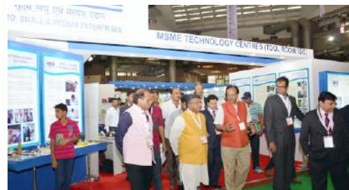
Shri Ravi Shankar Prasad, Union Electronic & IT Minister