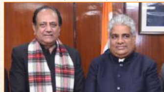
Sh. Bhupender Yadav Union Cabinet Minister for Environment, Forest & Climate Change; and Labour & Employment