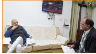
Sh. Amit Shah Union Home Minister, Minister of Cooperation and MP