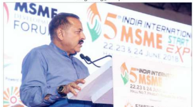
Dr. Jitender Singh, Union Minister (MSO) Prime Minister Office (PMO) & DONAR