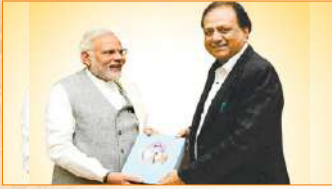
Sh. Narendra Modi Prime Minister of India