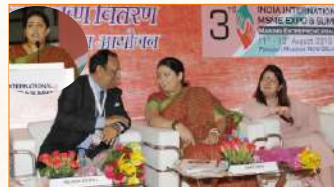
Smt. Smriti Irani, Minister of women & Child Development addressing the Expo-Summit