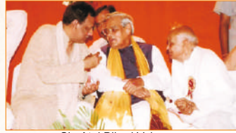
Sh. Atal Bihari Vajpayee Former Prime Minister of India