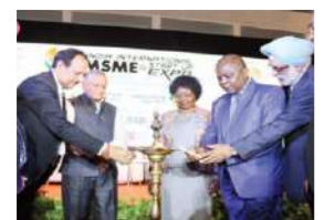
Gen. V.K. Singh MOS Civil Aviation with MSME Minister of Zimbabwe & Ambassador of Zimbabwe