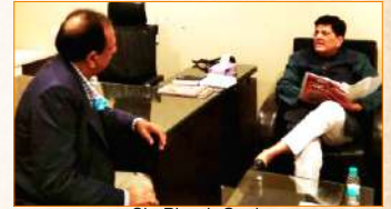
Sh. Piyush Goel, Union Minister of Commerce, Industry, Textiles & Consumer Affairs