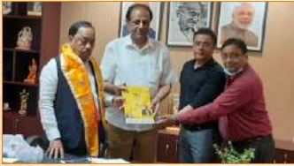
Sh. Narayan Rane, Union Minister of MSME