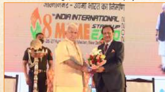
Sh. Manoj Sinha Jammu & Kashmir Lieutenant Governor