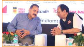
Dr. Jitender Singh Union Minister (MOS) Prime Ministers Office (PMO)