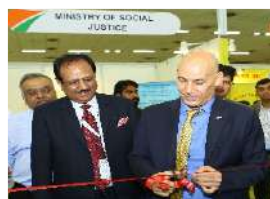
Ambassador of Israel