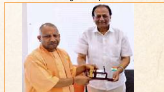
Sh. Yogi Adityanath, Chief minister of Uttar Pradesh