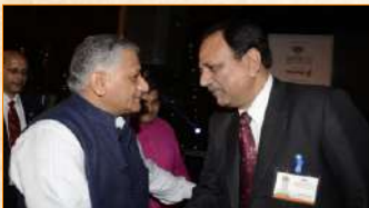
General Vijay Kumar Singh, Union Minister (MSO), Ministry of Road Transport and Highways