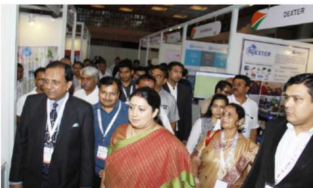
Smt. Smriti Irani Ministry of Woman & Child Development Ministry of Minority Affairs