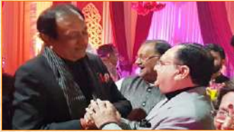
Sh. JP Naddha, President of Bhartiya Janta Party