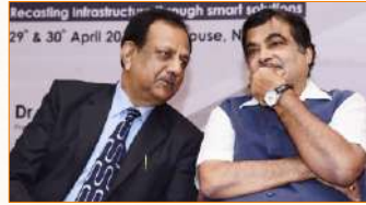
Sh. Nitin Gadkari, Union Minister of Road Transport & Highways