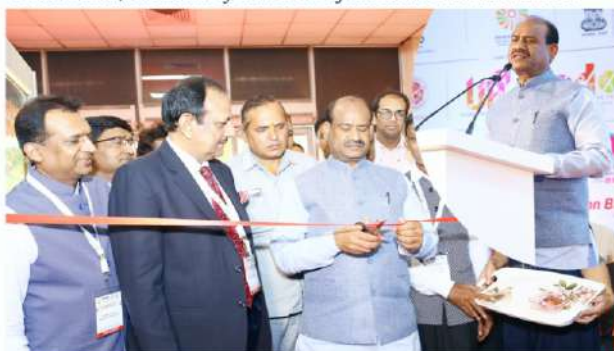
Sh. Om Birla, Speaker of Indian Parliament