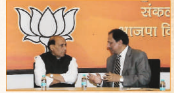
Sh. Rajnath Singh, Union Defence Minister