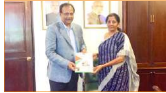
Smt. Nirmala Sitharaman, Union Finance Minister