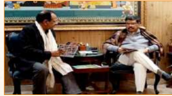
Sh. Dharmendra Pradhan, Union Minister of Education, Skill Development & Entrepreneurship