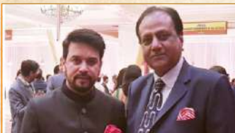
Sh. Anurag Thakur, Union Minister of I&B, Youth Affair & Sports