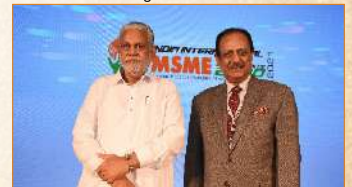
Sh. Parshotam Rupala Union Minister of Animal Husbandry, Dairying and Fisheries