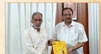
Shri Krishan Pal Gurjar, MOS-Heavy Industries & Public Enterprises & Power