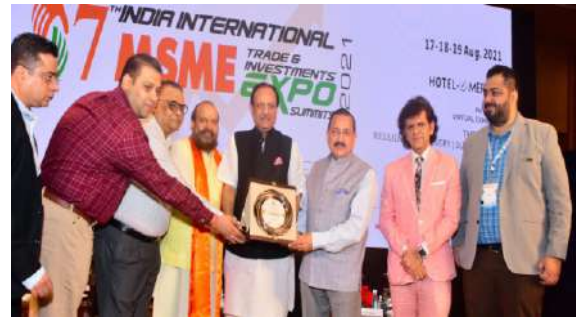
Dr. Jitender Singh Union Minister (MOS) Prime Ministers Office (PMO)